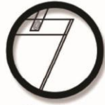
Heavy Duty Side Seal