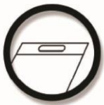
Die Cut handle