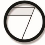
Normal Side Seal